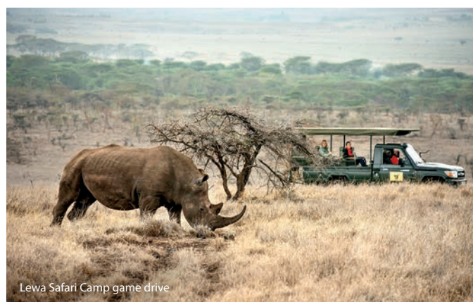
Lewa Safari Camp game drive

This safari captures the very best of Kenya and Tanzania and is the most likely route for observing the Great Migration of wildebeests and zebras as they cross the great plains of East Africa.