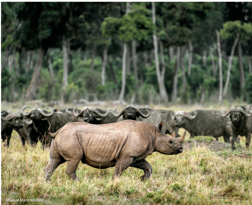
Maasai Mara wildlife