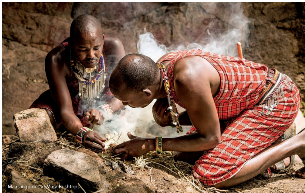
Maasai guides at Mara Bushtops