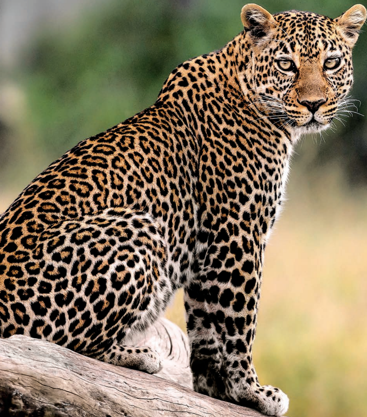
Maasai Mara leopard