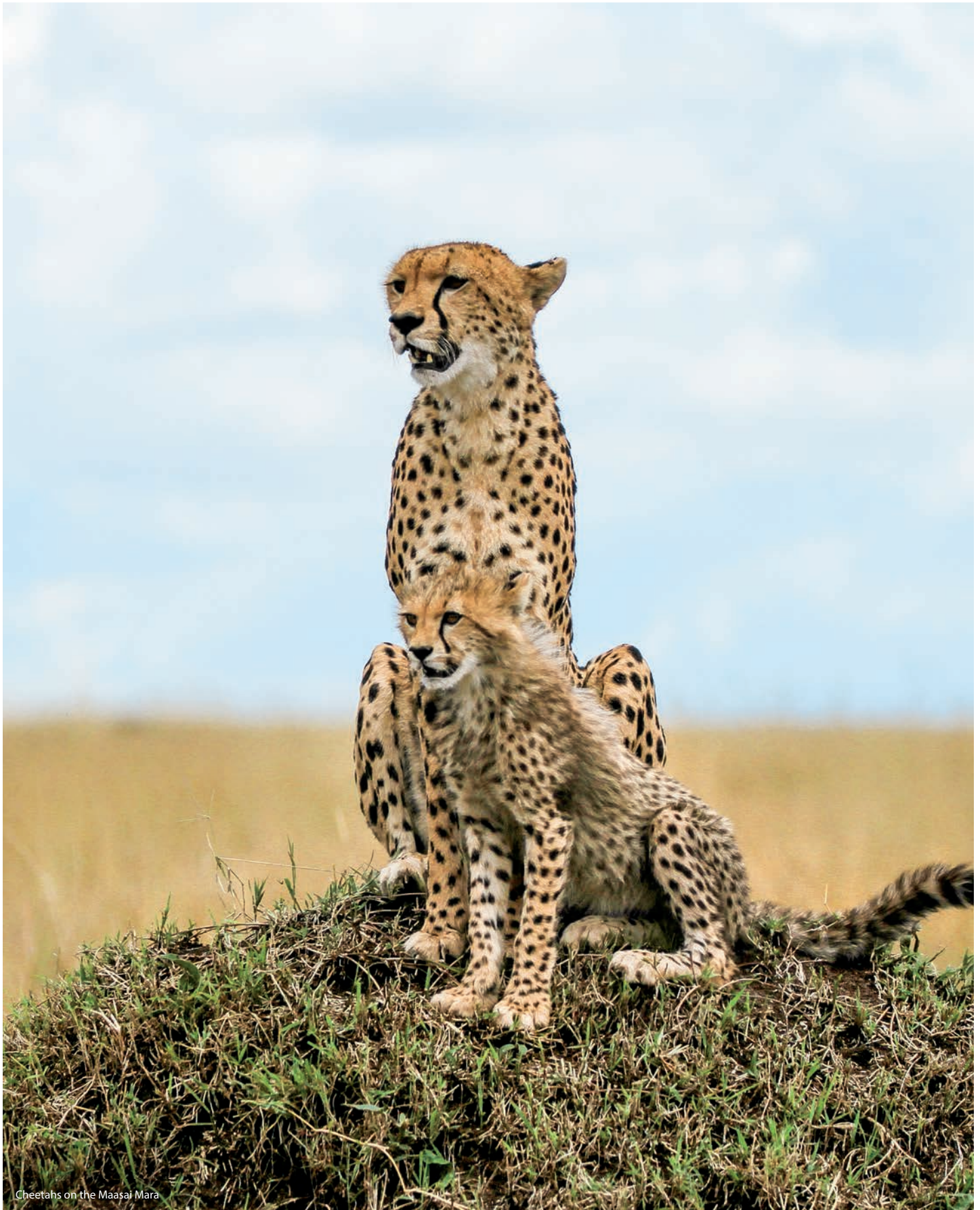
Cheetahs on the Maasai Mara