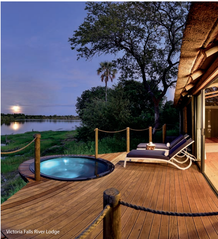
Victoria Falls River Lodge