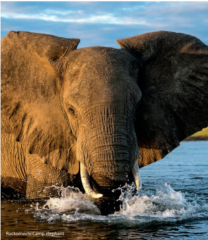
Ruckomechi Camp elephant