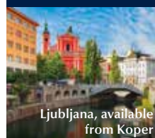
Ljubljana, available from Koper

$199 Premium Economy Air Upgrade Available*