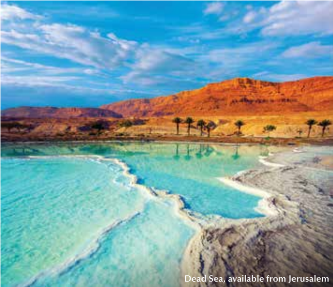
Dead Sea, available from Jerusalem

2 for 1 Cruise Fares FREE Roundtrip Airfare* FREE Airport Transfers* plus choose one: FREE 8 Shore Excursions FREE Beverage Package FREE $800 Shipboard Credit