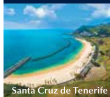
Santa Cruz de Tenerife

$199 Premium Economy Air Upgrade Available*