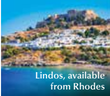
Lindos, available from Rhodes

2 for 1 Cruise Fares FREE Roundtrip Airfare* FREE Airport Transfers* plus choose one: FREE 4 Shore Excursions FREE Beverage Package FREE $400 Shipboard Credit $199 Premium Economy Air Upgrade Available*