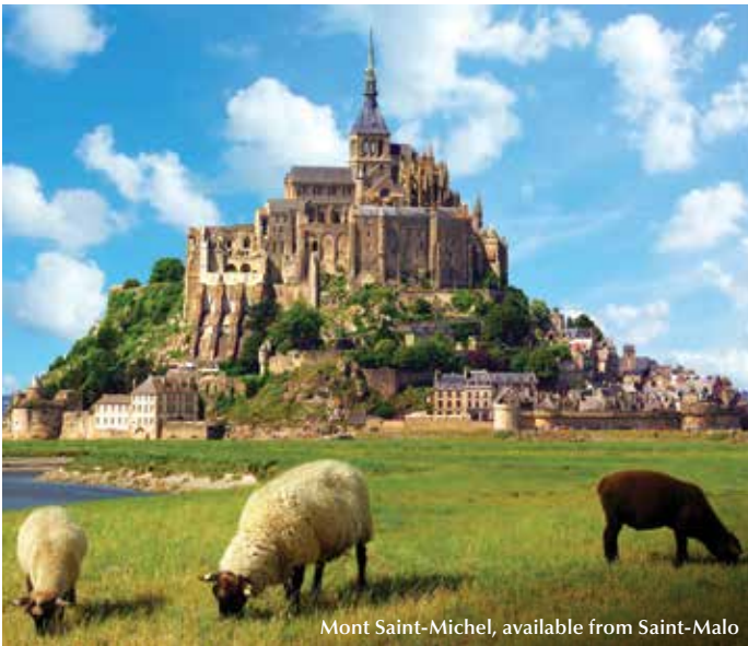
Mont Saint-Michel, available from Saint-Malo

2 for 1 Cruise Fares FREE Roundtrip Airfare* FREE Airport Transfers* plus choose one: FREE 12 Shore Excursions FREE Beverage Package FREE $1,200 Shipboard Credit $199 Premium Economy Air Upgrade Available*