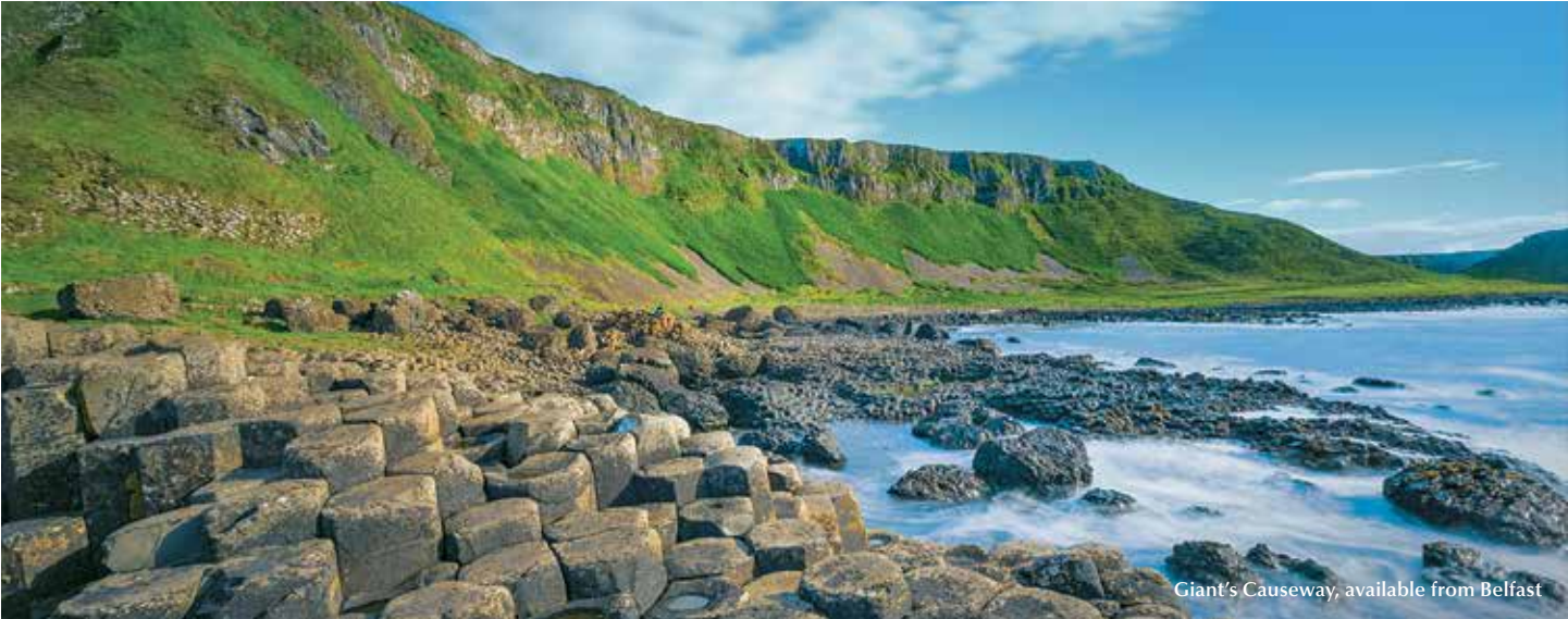
Giant's Causeway, available from Belfast

2 for 1 Cruise Fares FREE Roundtrip Airfare* FREE Airport Transfers* plus choose one: FREE 6 Shore Excursions FREE Beverage Package FREE $600 Shipboard Credit $199 Premium Economy Air Upgrade Available*