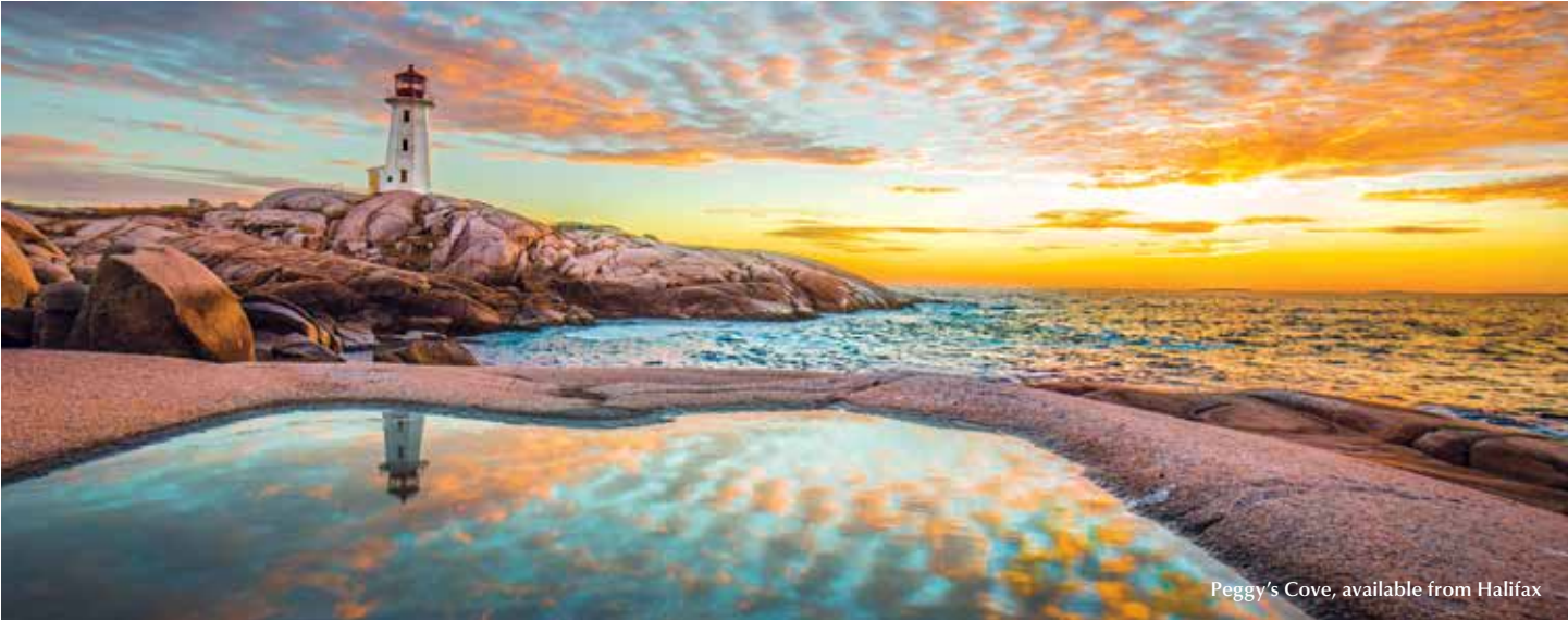
Peggy's Cove, available from Halifax

2 for 1 Cruise Fares FREE Roundtrip Airfare* FREE Airport Transfers* plus choose one: FREE 10 Shore Excursions FREE Beverage Package FREE $1,000 Shipboard Credit