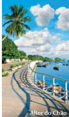
Alter do Chão

2 for 1 Cruise Fares FREE Roundtrip Airfare* FREE Airport Transfers* plus choose one: FREE 14 Shore Excursions FREE Beverage Package FREE $1,400 Shipboard Credit