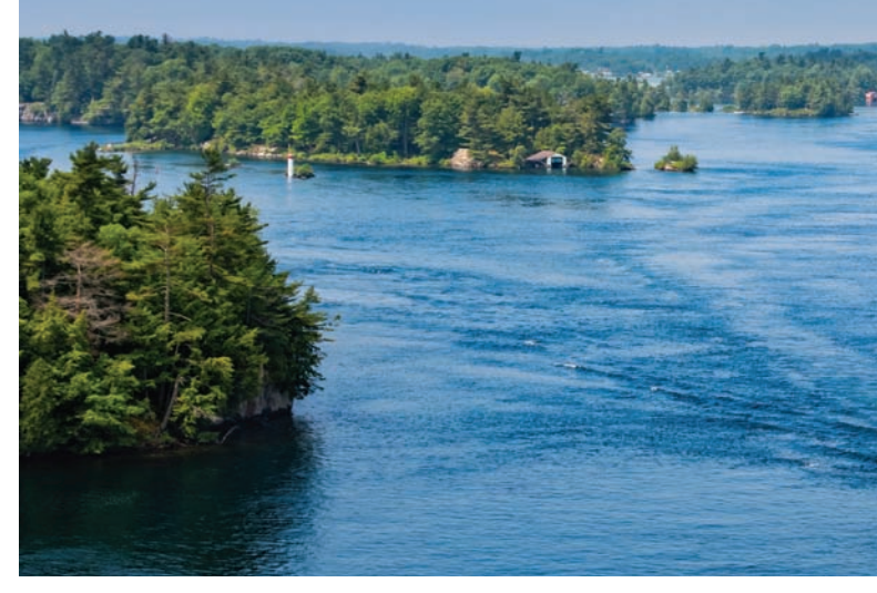
Cruise through the Thousand Islands to view opulent summer mansions and cottages gracing picturesque shores.

You'll feel like you've stepped into a 17th-century European village as you stroll along Old Quebec's cobblestone streets and enjoy a taste of the royal life during your three-night stay in your château-hotel overlooking the St. Lawrence River.