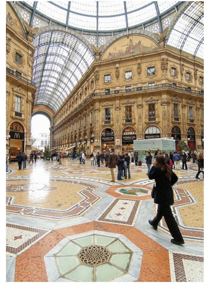
Discover the art and architecture of Milan on a panoramic drive through the city and on a locally guided walking tour.

Take a private boat to Isola Bella on Lake Maggiore and the exquisite Villa Borromeo. Count Vitaliano Borromeo began the construction of this opulent Baroque palace and its splendid gardens in 1632. A guided tour of the ornate