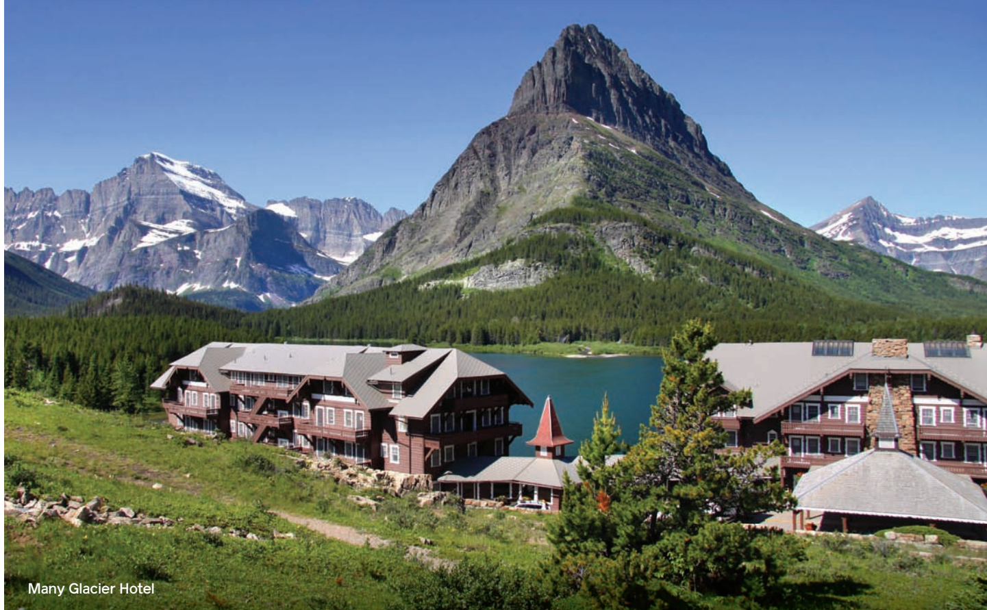
Many Glacier Hotel