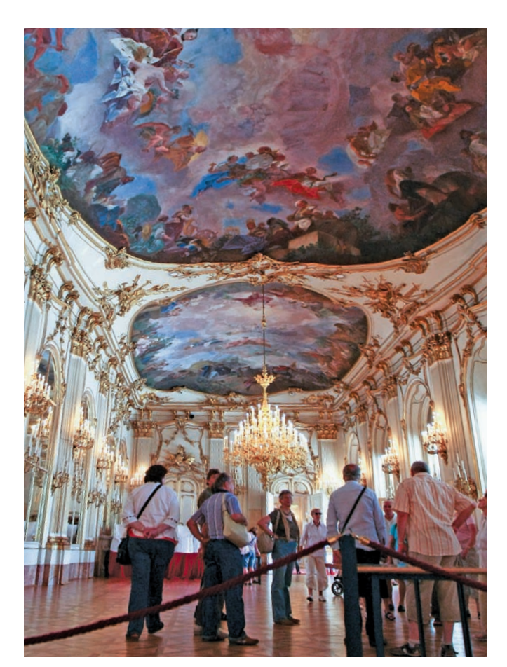
A private, after-hours tour of Schönbrunn Palace provides an opportunity to see the opulent art and architecture, unhurried.

Depart for Milan Central Station and settle in aboard the Danube Express , your hotel on wheels for the next three nights. An hour later, you'll arrive in Como for a walking tour of its charming narrow streets and pastel houses beside enchanting Lake Como, lined with stately villas, terraces and promenades, against a dramatic backdrop of snow-capped mountains. Visit the 14th-century marble Duomo, decorated with tapestries, frescoes, and paintings, for an exclusive organ concert for Tauck guests only. Then have lunch aboard the train as you head for the St. Gotthard Pass en route to Zurich. A spectacular landscape