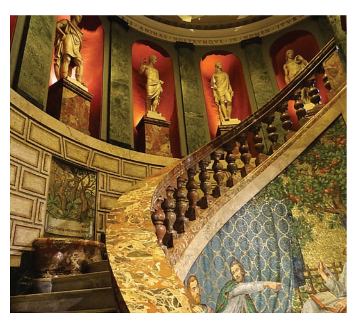
Biblioteca Ambrosiana in Milan houses the Pinacoteca Ambrosiana, an art gallery; visit it in the early opening hours, before the crowds.

Begin your day in Vienna with an exclusive concert with sparkling wine (or soft drinks) in an intimate setting, then return to the train for lunch. After checking into your hotel in the heart of the city, join us for a private, after-hours tour of Schönbrunn Palace, the opulent Habsburg summer residence inspired by Versailles. The rooms in the Baroque palace are ornate and beautiful, with a highlight being the magnificent Imperial apartments of Emperor Franz Joseph