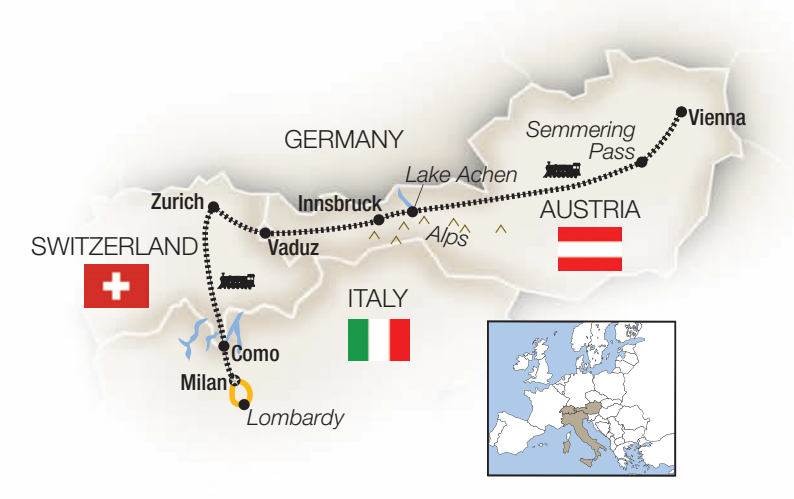
Maximum Elevation: 3,776 ft.

Enjoy an exclusive early-opening guided visit at the Ambrosiana, one of Milan's most acclaimed art galleries, before the day's crowds arrive. Continue exploring city sites with a local guide. See the Milan Cathedral (the Duomo),