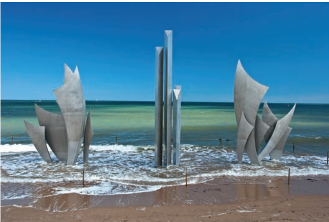
A visit to the haunting D-Day beaches of Normandy with our local expert will be one of your most memorable experiences in France.

A local guide gives a tour at the Musée d'Orsay, where a treasure trove of Impressionist and Post-Impressionist art is housed in a renovated Beaux-Arts railway station. Join us for a farewell reception with stunning panoramic views of the Eiffel Tower and the city skyline, followed by a gourmet dinner served with French flair. Meals BD