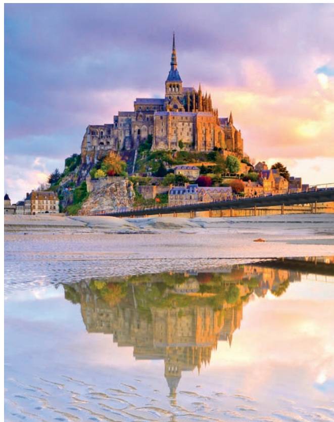
There is something mystical about the small village of Le Mont-Saint-Michel, especially when it becomes an island at high tide.

country for a two-night stay at Château de Rochecotte, once the private estate of diplomat Prince Talleyrand and the Duchess of Dino. Tonight, enjoy an immersive Loire Valley experience at Château de Champchevrier, a private country estate, where you'll meet the Baron and his family, enjoy a reception and dinner, and witness a hunting hound demonstration in full regalia. Meals BD