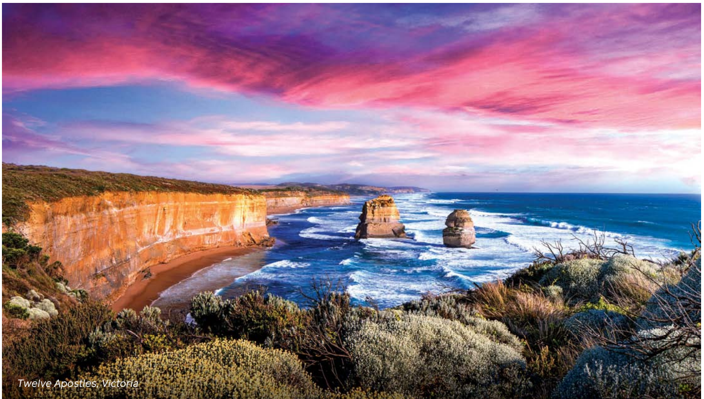
Twelve Apostles, Victoria