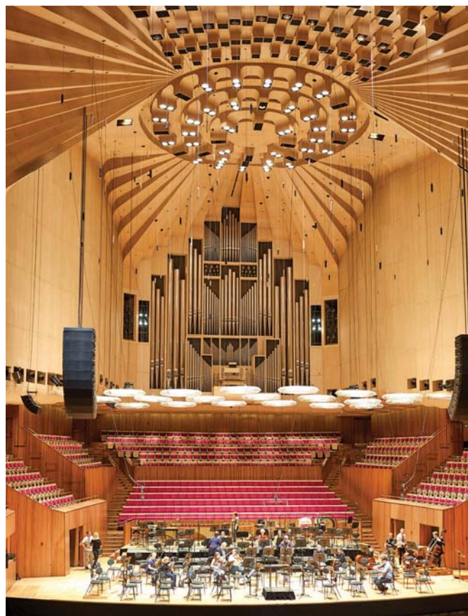
Two nights in Sydney include a private tour of one of the world's great architectural triumphs, the Sydney Opera House.

Fly from Adelaide to Melbourne, the coastal capital of Victoria. Enjoy lunch in a garden-filled setting, before setting off for a guided walking tour along Melbourne's laneways