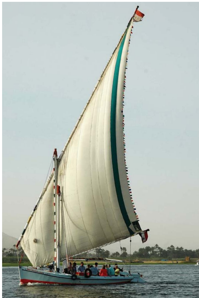
Explore Egypt and Jordan via different transportation modes, including a marvelous sunset cruise by felucca on the Nile.