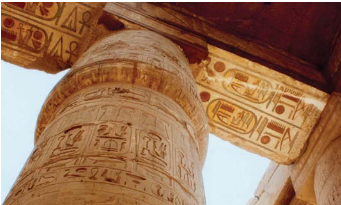
The antiquities you'll view throughout Egypt tell the stories of great dynasties, including Luxor's Karnak Temple complex.