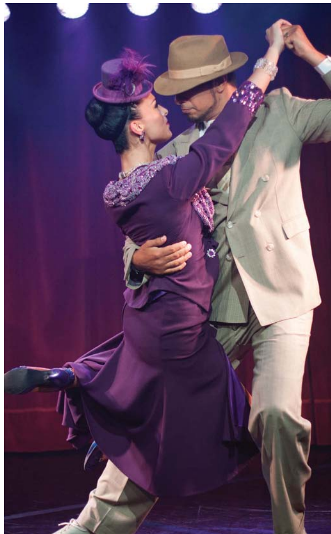
Tango was born in the streets of Buenos Aires in the late 1880s finding its footing in storied dances still popular today.

Weather permitting, a cruise through Última Esperanza Sound introduces you to a mystical landscape of fjords, mountains, cliffs and caves, plunging waterfalls, and ice floes. Keep your eyes peeled for cormorants and nesting condors. Disembark at glacier-filled Bernardo O'Higgins National Park for an easy trek through the unspoiled wilderness to a viewpoint overlooking massive Serrano Glacier, and take in bluish white Balmaceda Glacier creeping over Monte Balmaceda. Stop for lunch at a local estancia, before returning to your hotel for a historical walking tour of the property. Join us in the hotel's award-winning restaurant for a special wine-pairing dinner featuring Chilean wines and regional cuisine, promising a memorable taste of local specialties. Meals BLD